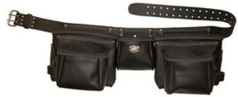
Dead On Professional Oil Tanned Leather Work Apron On Sale $48.94

Full Line Distributor for Bucket Boss, Maasdam JackAll, Dead On, CLC Custom Leathercraft, Vaughan, Dalluge, Seber Knife, Panasonic, IDL Tools, Stiletto, Milwaukee, and TommyCo